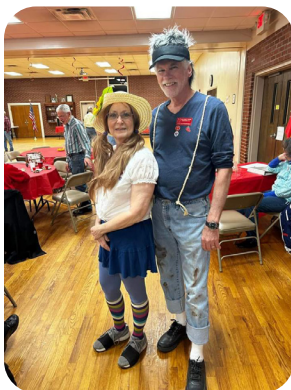
Sadie Hawkins Dance