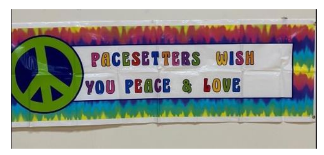
Pacesetters Flower Power Dance