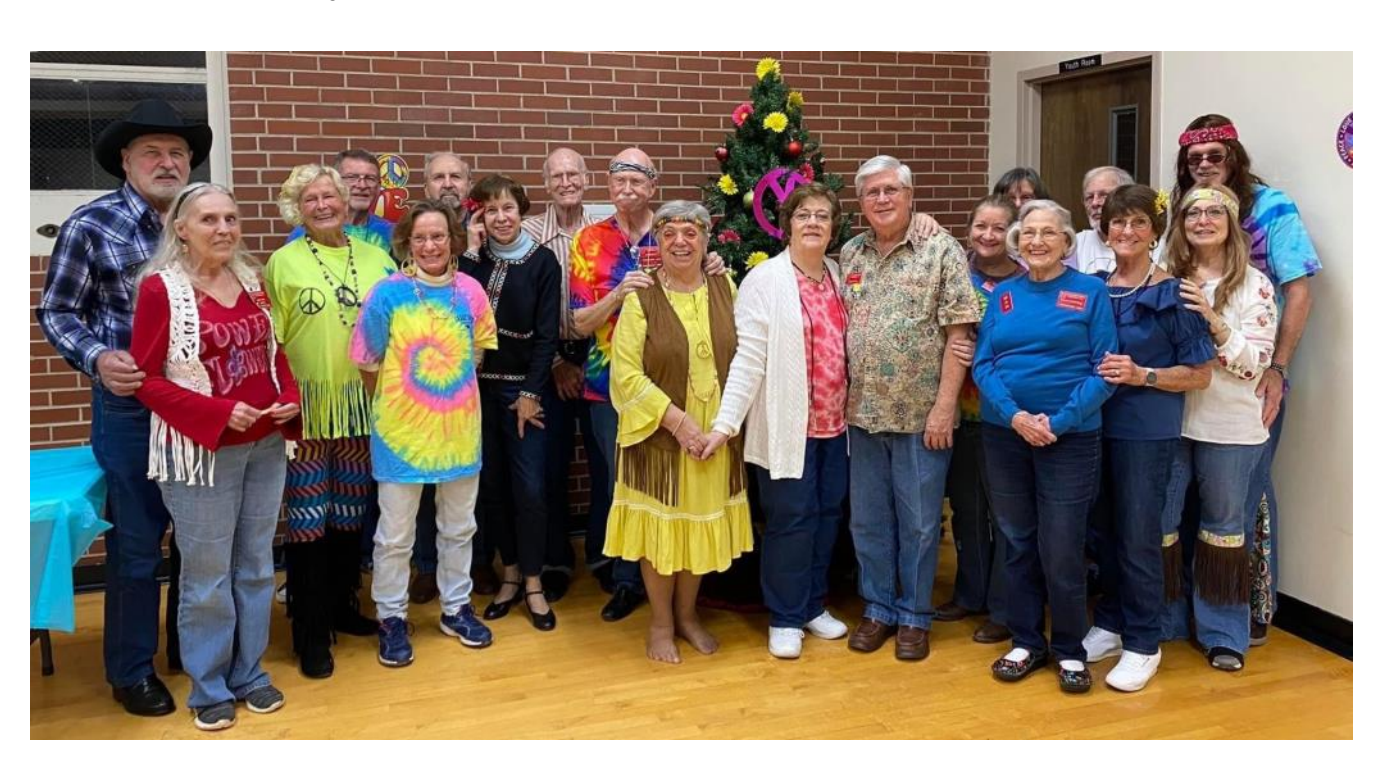
Pacesetters Flower Power Dance