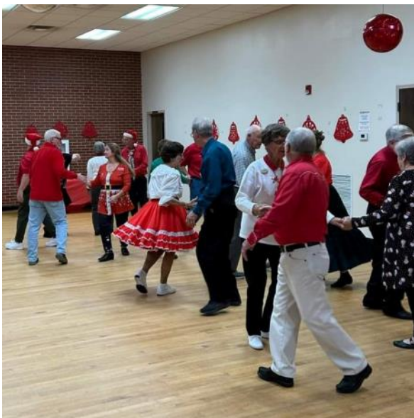
PACESETTERS' CHRISTMAS DANCE