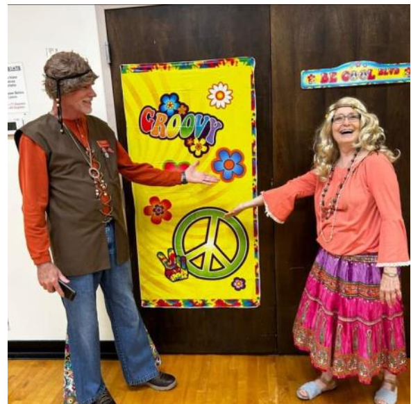
PACESETTERS' HIPPIY DANCE