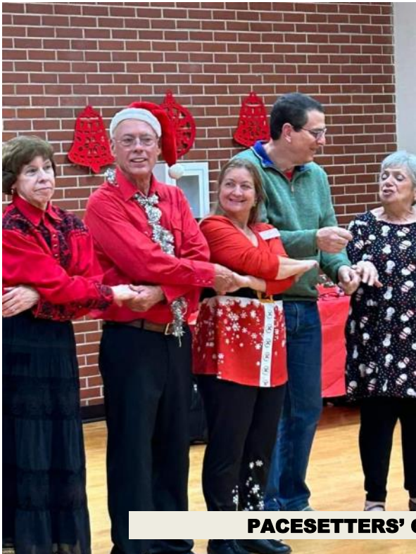
PACESETTERS' CHRISTMAS PARTY